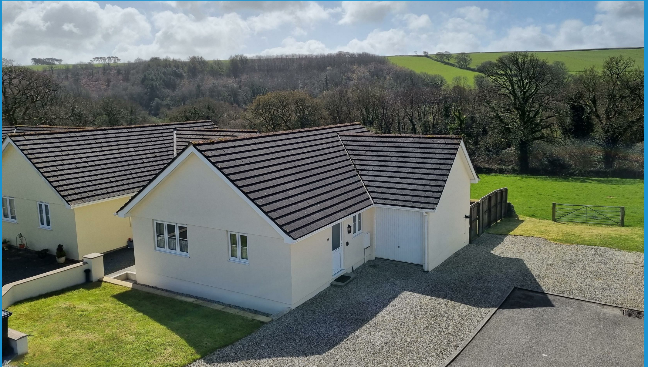
19 Well Meadow Egloskerry | Launceston