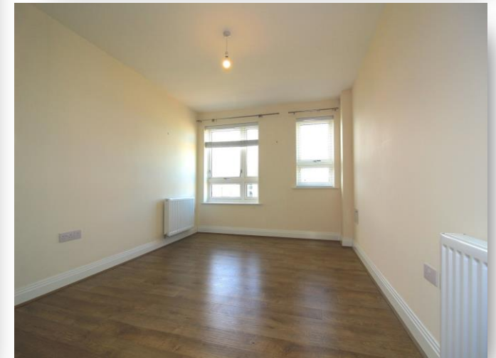
Flat 24 Heathland Court, 3 Grebe Way, Maidenhead SL6 8DE