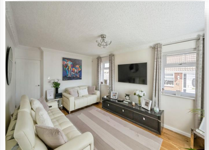
Wharf Close, Swinton Mexborough S64 8DA