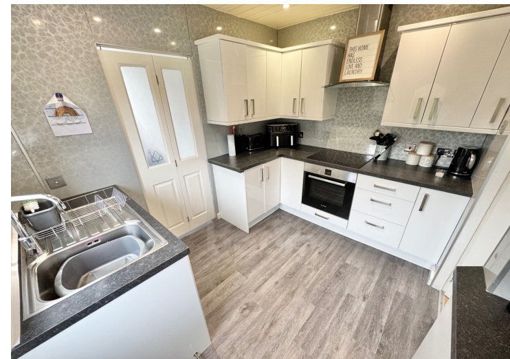
Moorhouse Avenue, Paisley