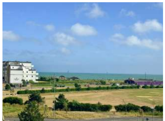
Views from Balcony