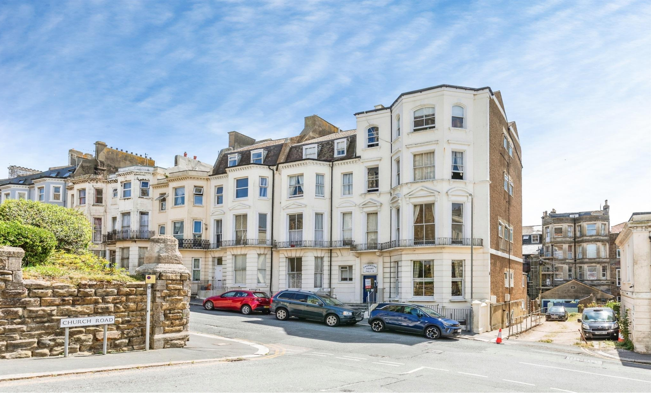
Charmaine Court - St. Margarets Road, St. Leonards-On-Sea TN37 6EH