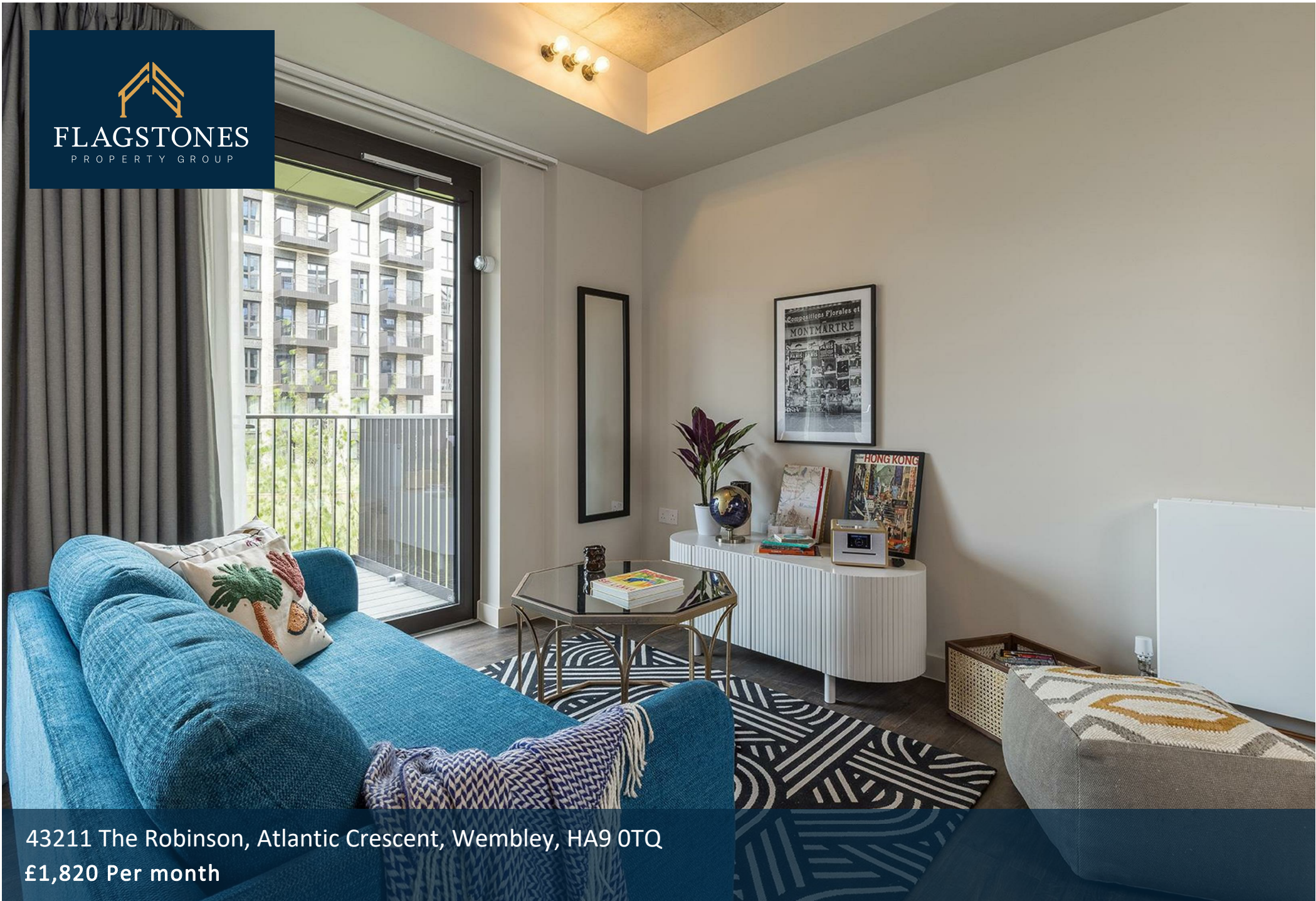
43211 The Robinson, Atlantic Crescent, Wembley, HA9 0TQ £1,820 Per month