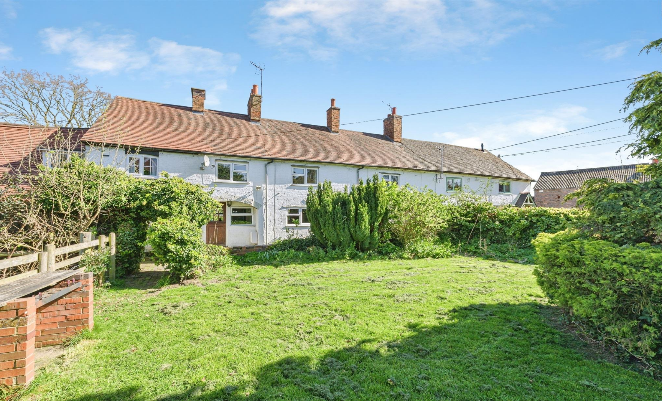
Bullocks End Cottages, Drayton Lane, Drayton Bassett, Tamworth