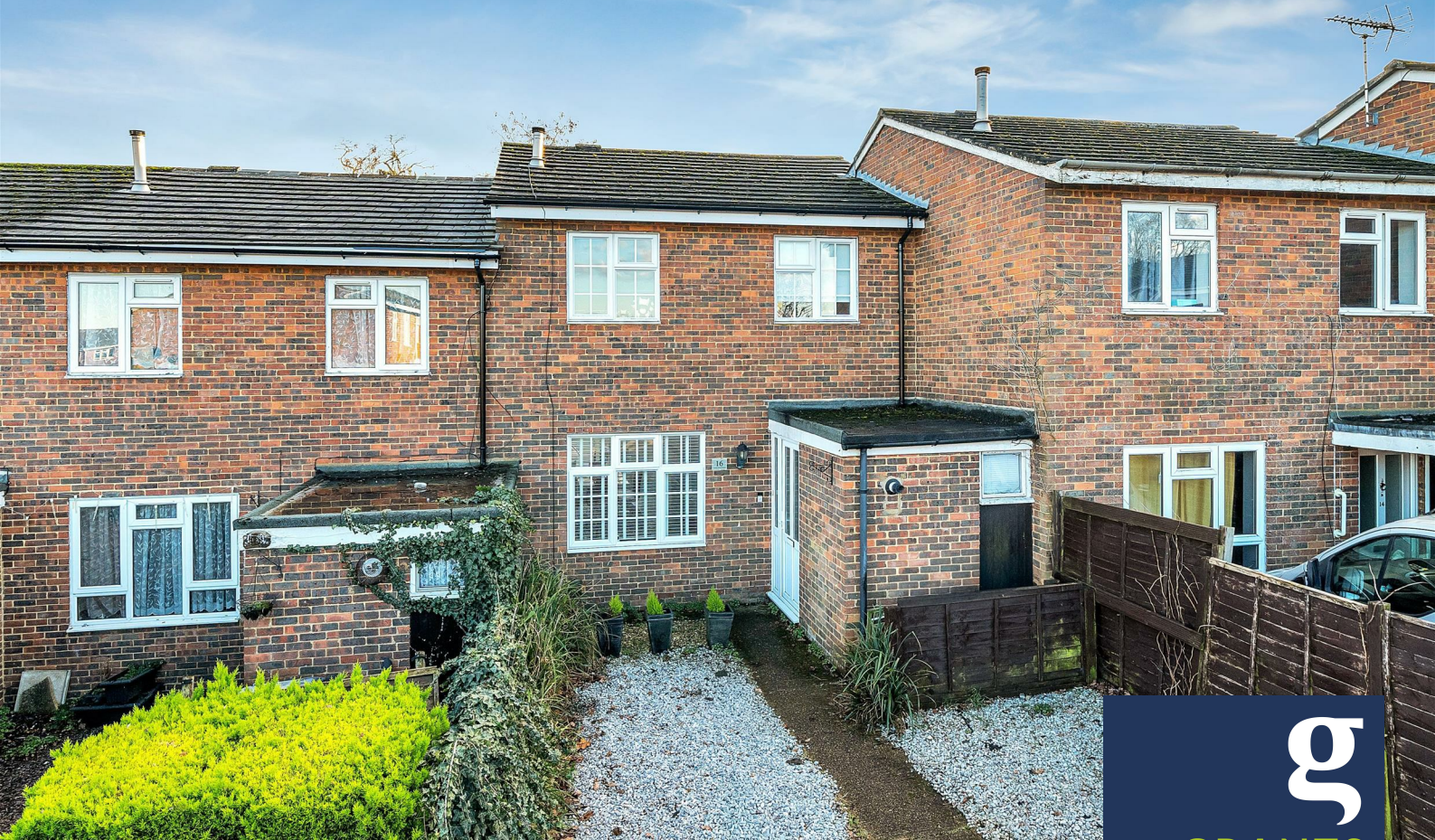
Templefield Close, Addlestone, KT15 1LR