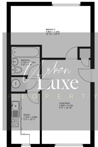
▲ Ground floor

Approx total area - 38.65 m 2 / 415.78 sq ft