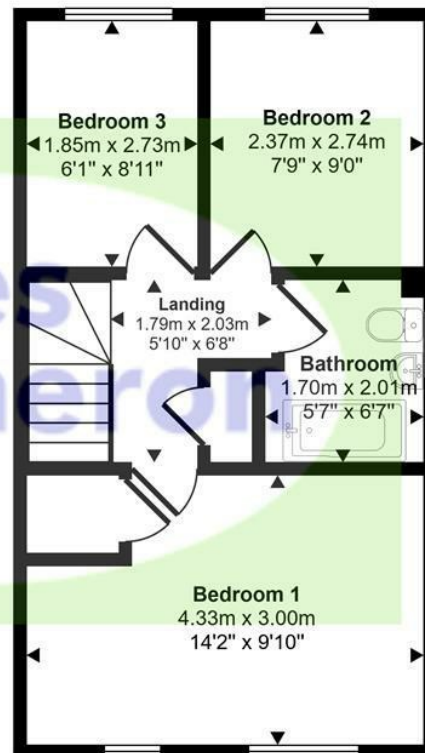
First Floor Approx 35 sq m / 377 sq ft