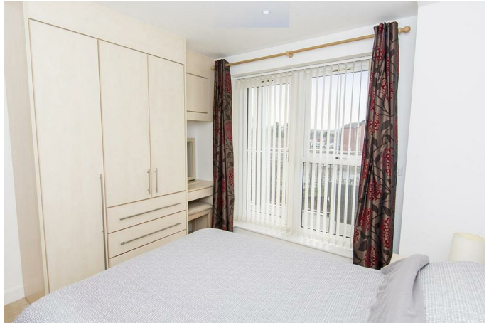
Bedroom Two 10'3" x 10'10" (3.12m x 3.30m)

Double-glazed French door opening out to the balcony. Sharps fitted wardrobes and dressing table. Electric panel heater.