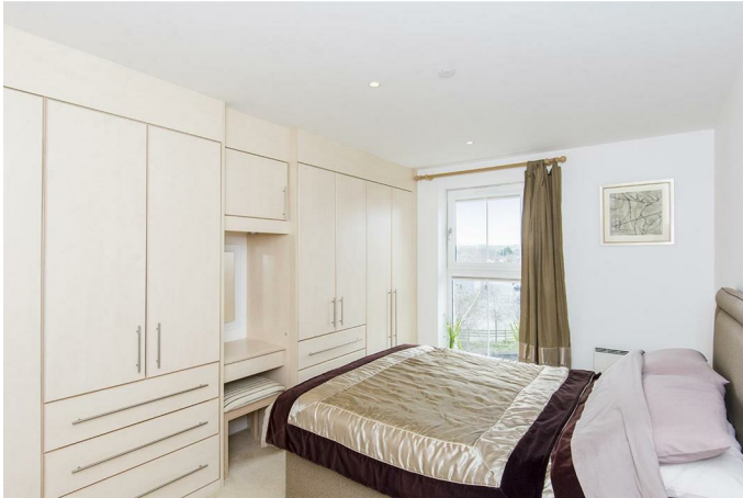
Bedroom One 14'8" x 10'8" (4.47m x 3.25m)

Double-glazed window to the rear aspect with fitted blinds. Electric panel heater. Sharps fitted wardrobes and dressing table.