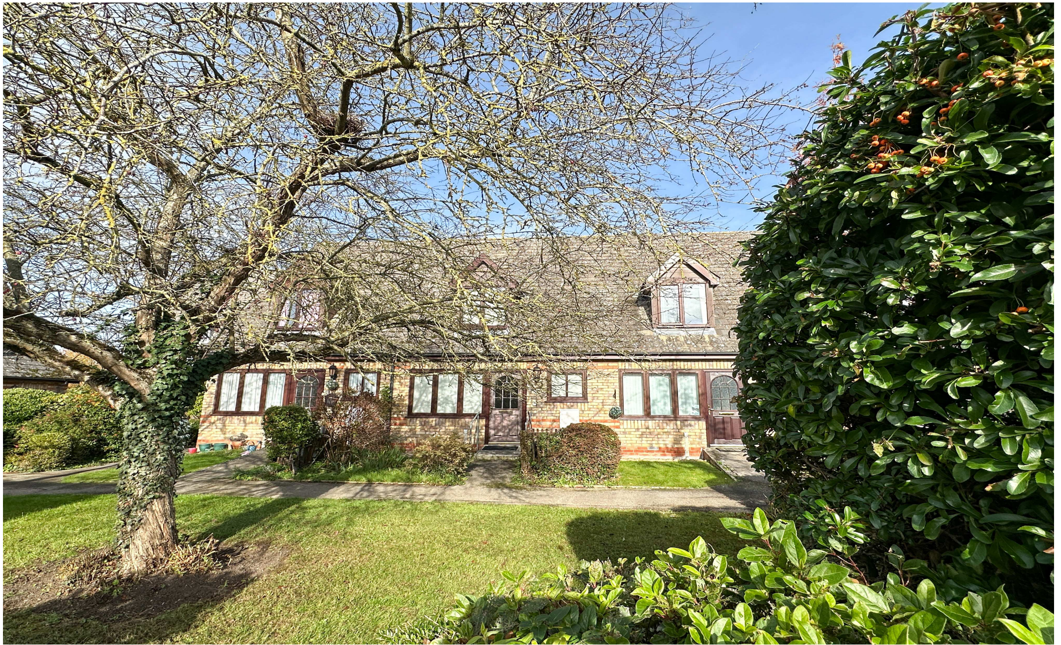
Ash Grove Burwell Cambridgeshire