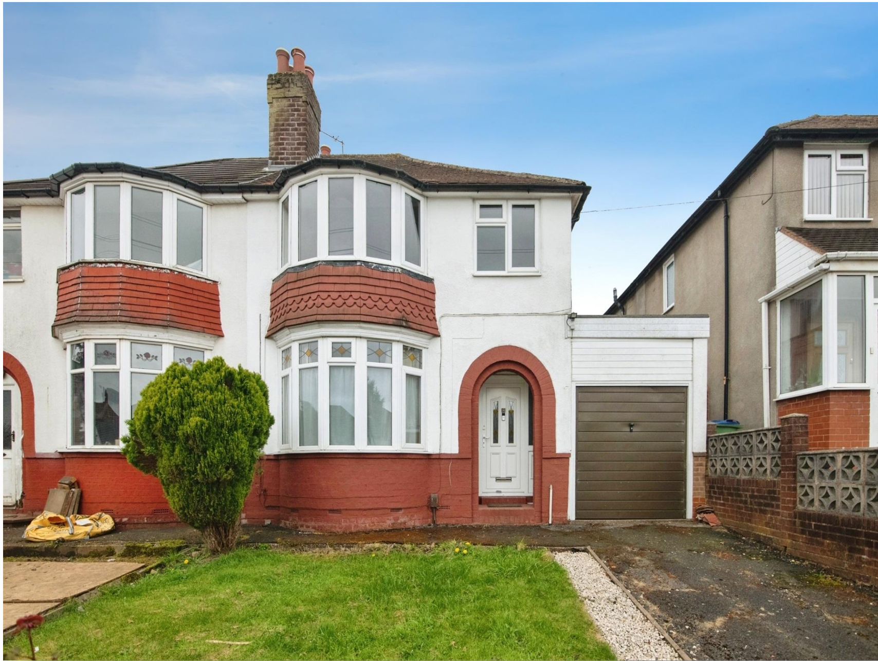
Poplar Avenue, Tividale Oldbury B69 1RG