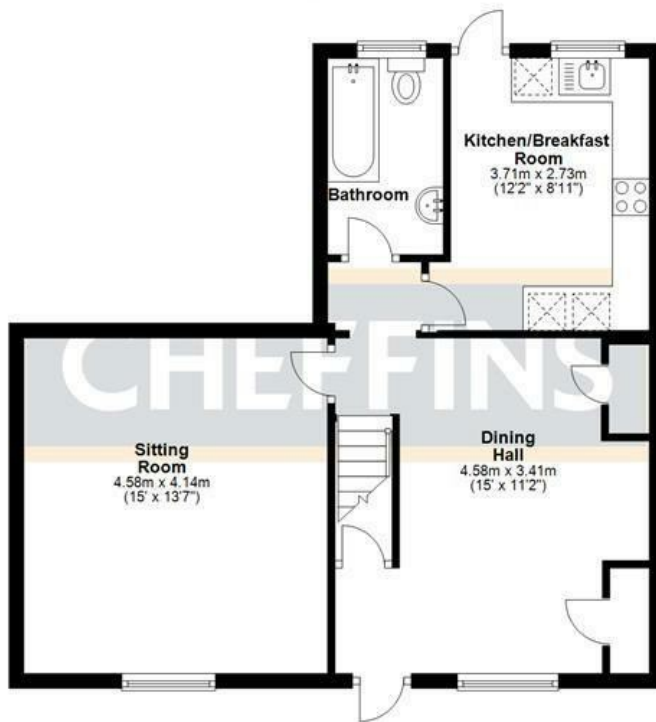
Ground Floor Approx. 55.9 sq. metres (601.2 sq. feet)