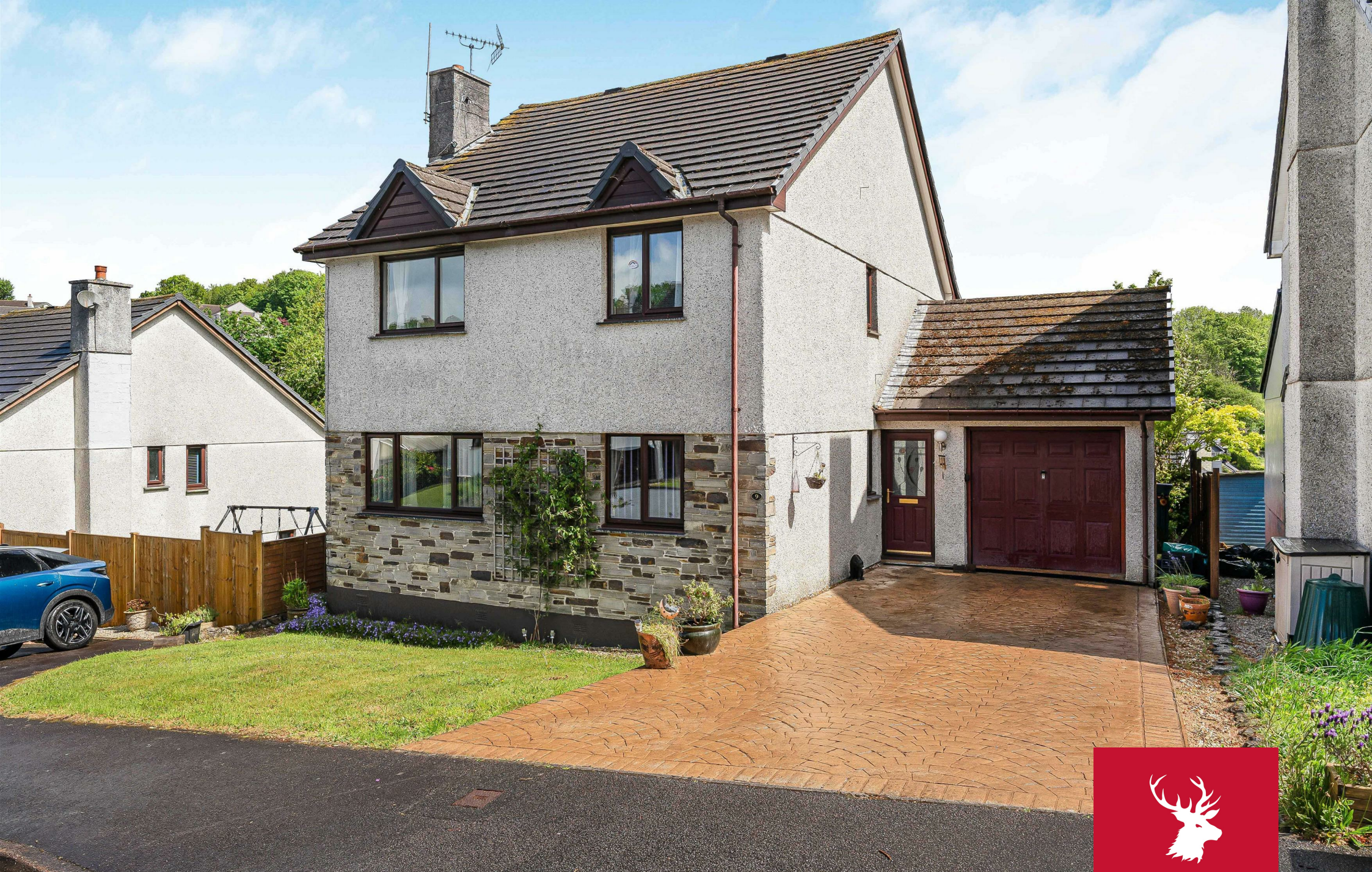
9, The Dell