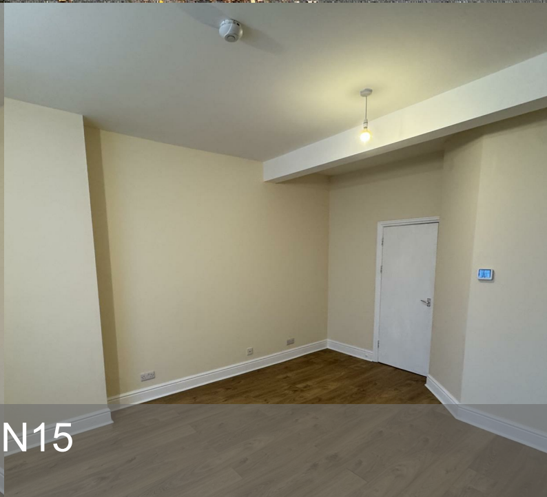
North Grove, Seven Sisters, N15