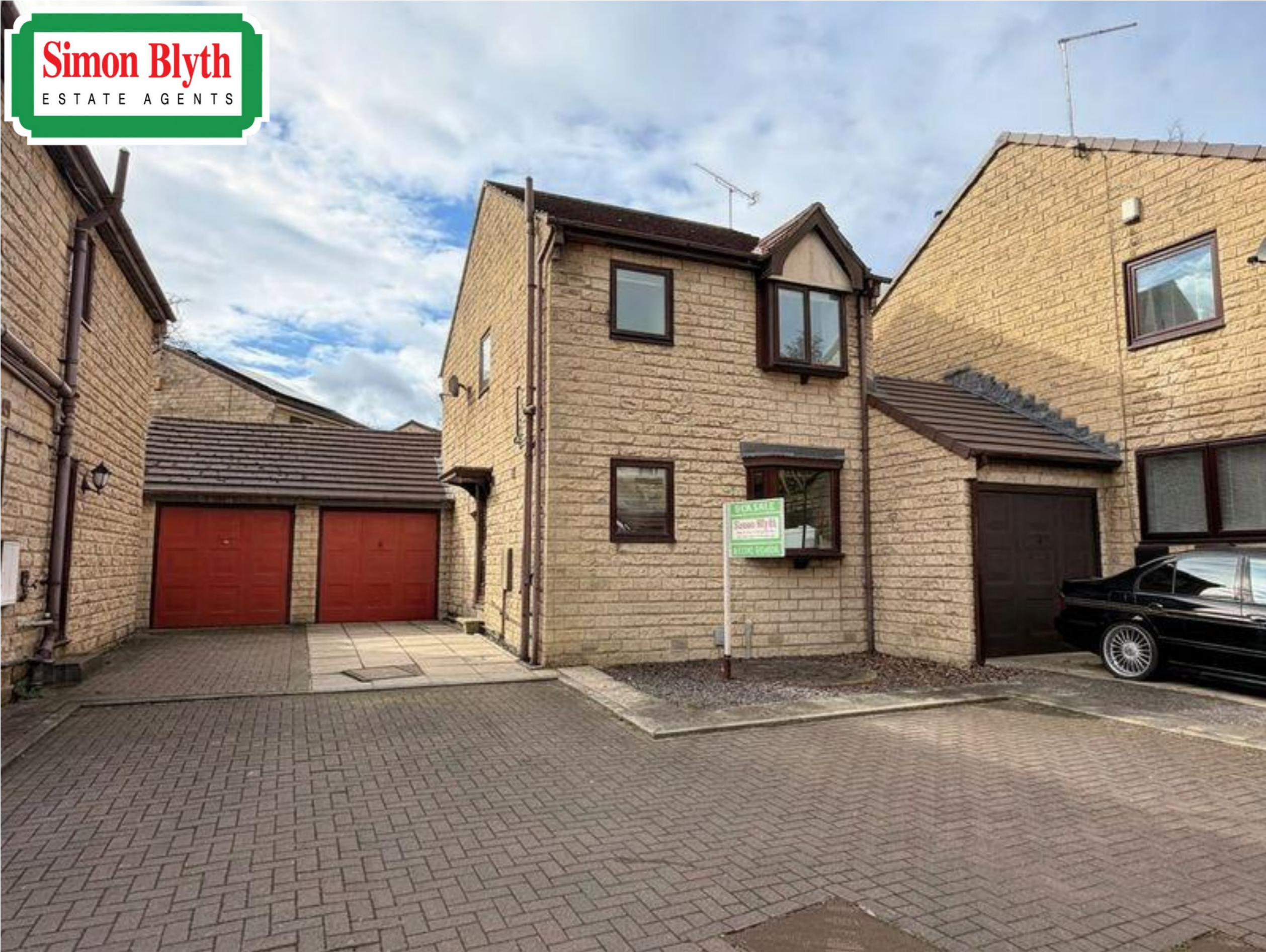
CUBLEY BROOK COURT, PENISTONE