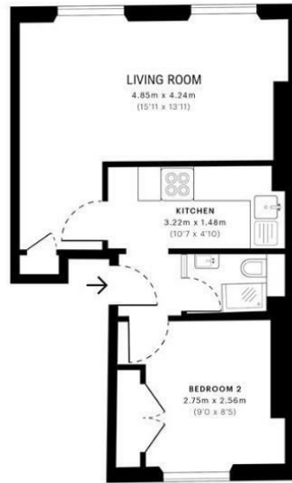
— Second Floor

GROSS INTERNAL AREA 32.66 sqm / 351.55 sqft