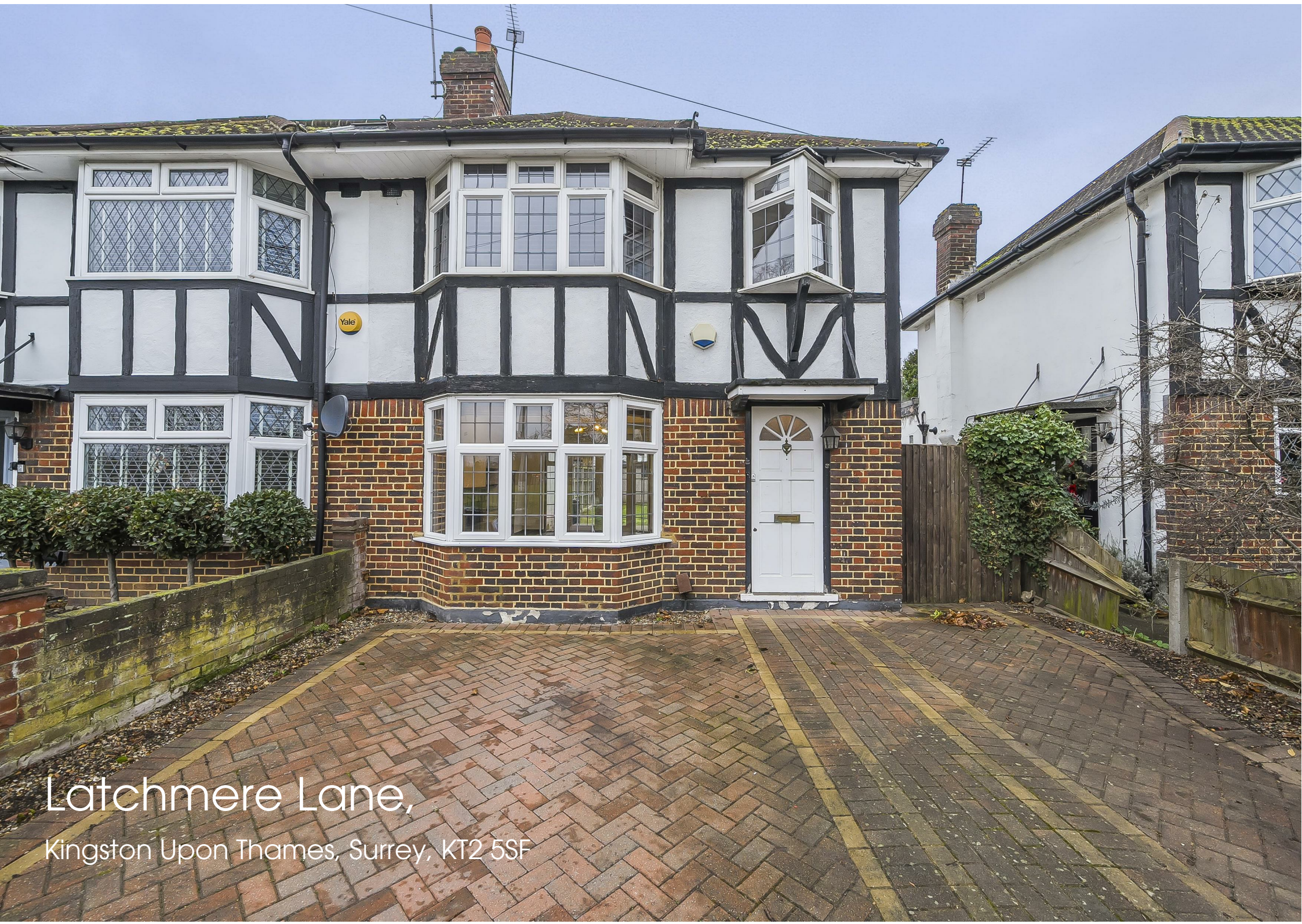
Latchmere Lane, Kingston Upon Thames, Surrey, KT2 5SF

34 Richmond Road Kingston upon Thames Surrey KT2 5ED www.gibsonlane.co.uk Tel: 020 8546 5444