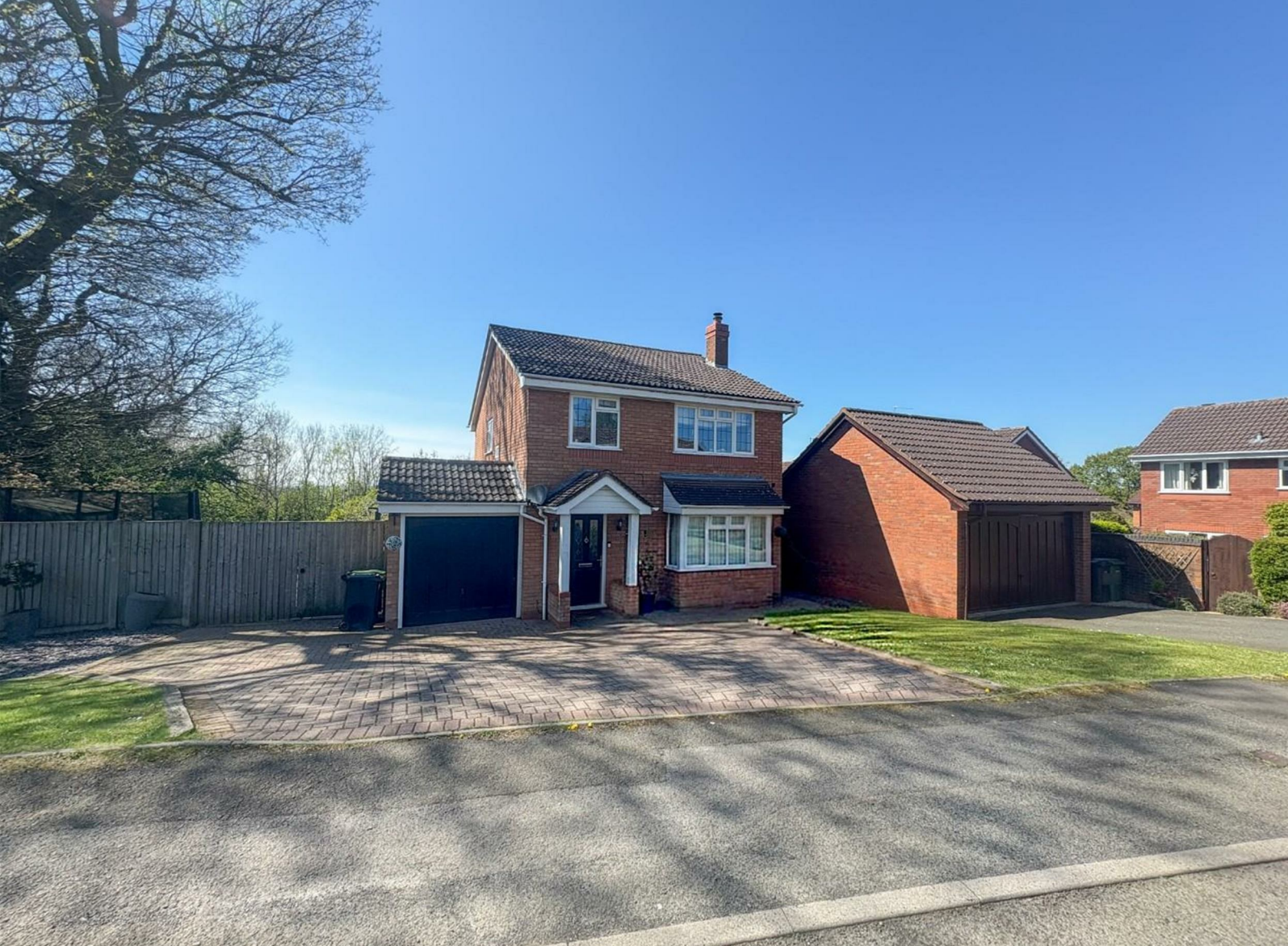
Epsom Close, Redditch