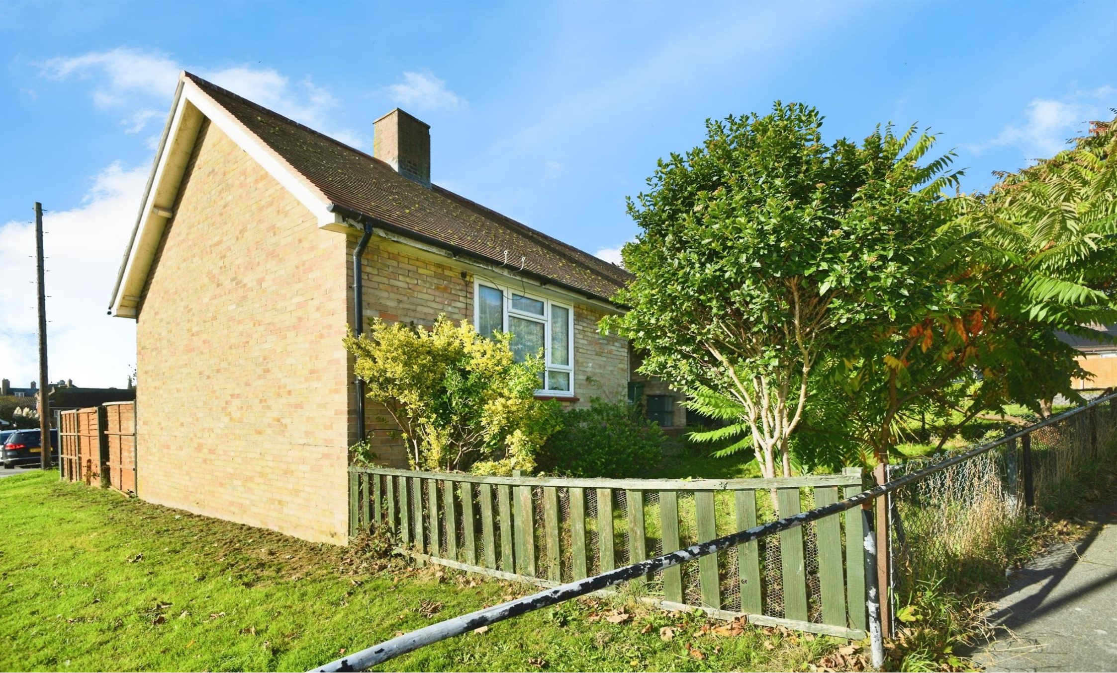
Manor Gardens, Brighton BN2 5EB