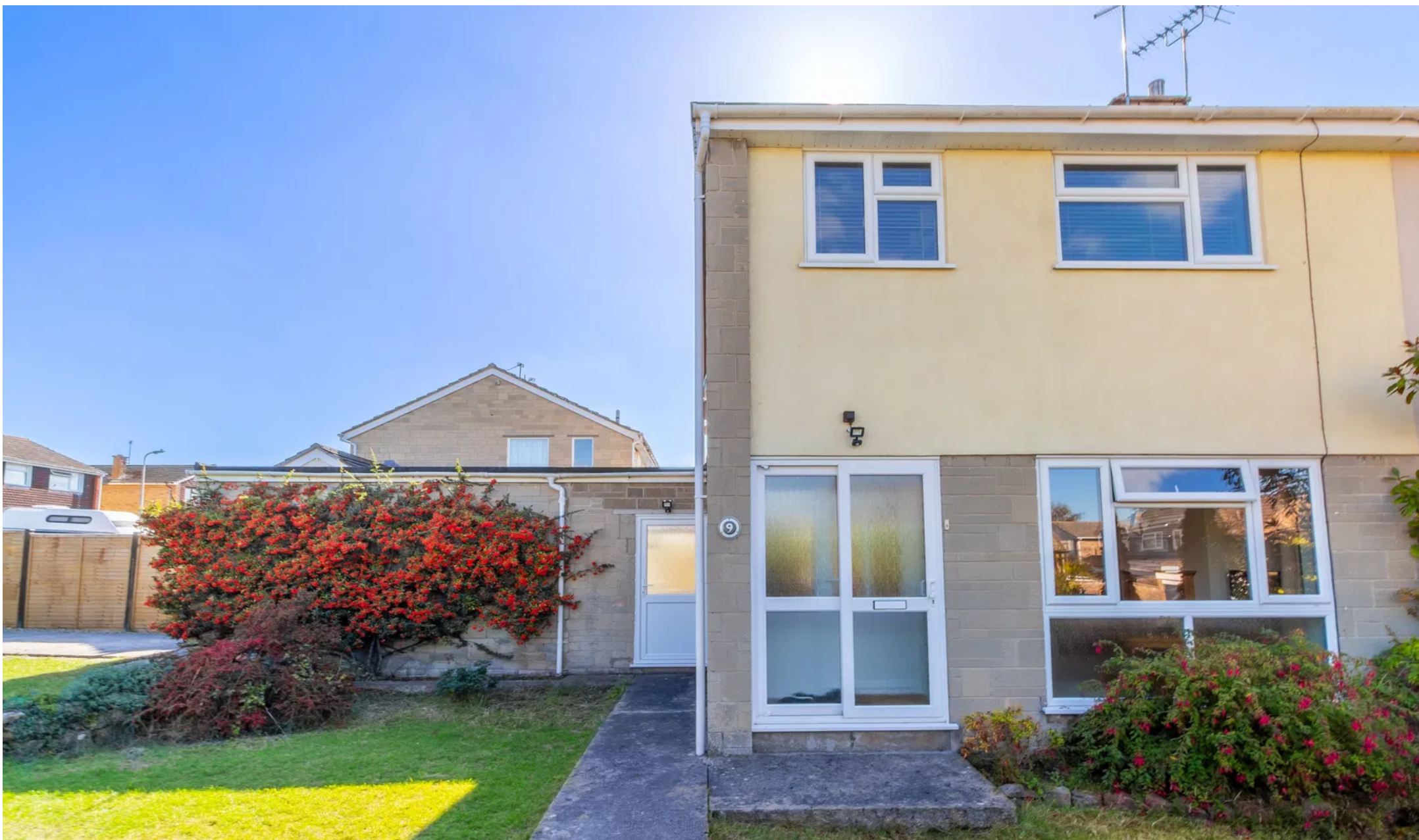
Stonewell Grove, Congresbury £360,000