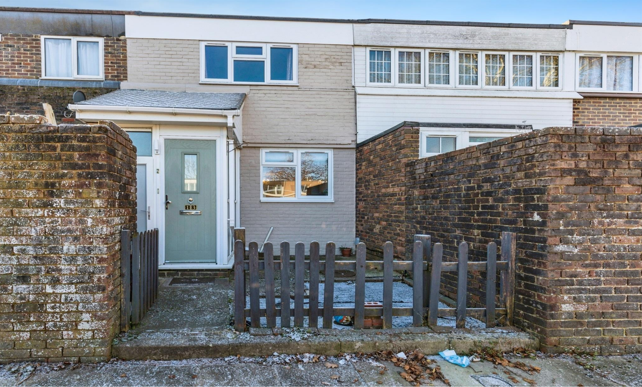
Borage Close, Crawley, RH11 9EL