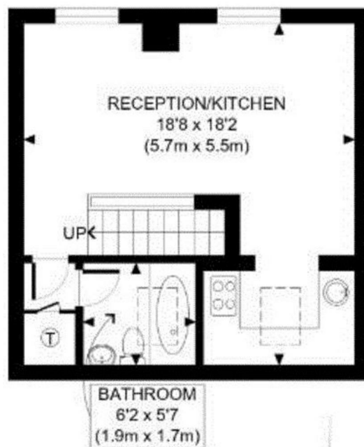
THIRD FLOOR GROSS INTERNAL FLOOR AREA 339 SQ FT

APPROX. GROSS INTERNAL FLOOR AREA: 562 SQ FT/ 52 SQM