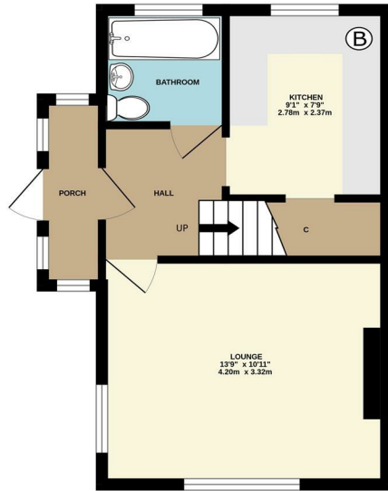
GROUND FLOOR 339 sq.ft. (31.5 sq.m.) approx.