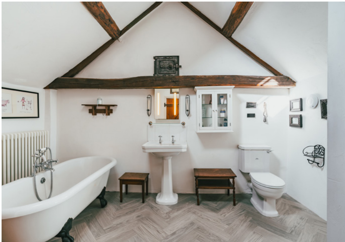
MASTER EN-SUITE BATHROOM