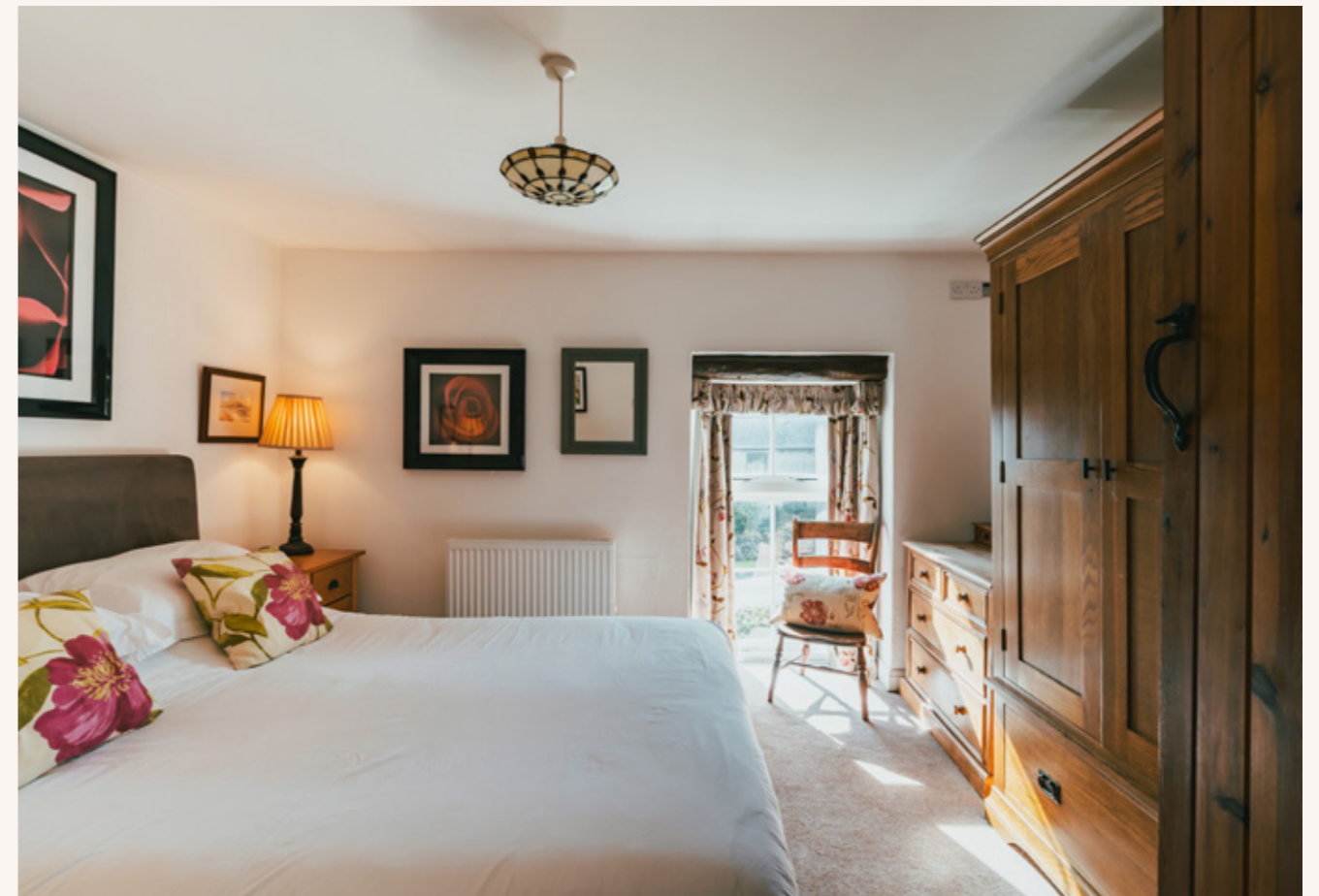
BEDROOM - HOLIDAY COTTAGE