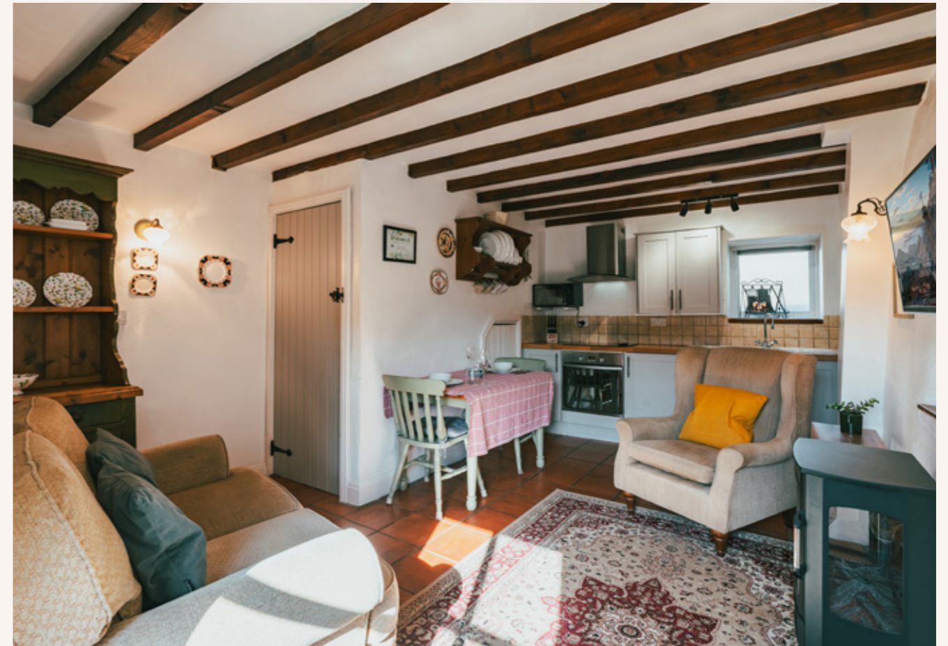
LIVING KITCHEN - HOLIDAY COTTAGE

Having a flush light point, extractor fan, fully tiled walls, chrome heated towel rail and an illuminated vanity mirror. A suite in white comprises a low-level WC and a wall mounted wash hand basin with a chrome mixer tap. To one wall is a walk-in shower enclosure with a fitted Mira shower and a glazed screen/door.