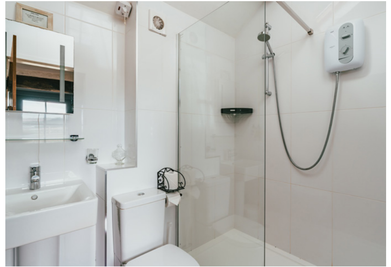
SHOWER ROOM - KEEPERS COTTAGE