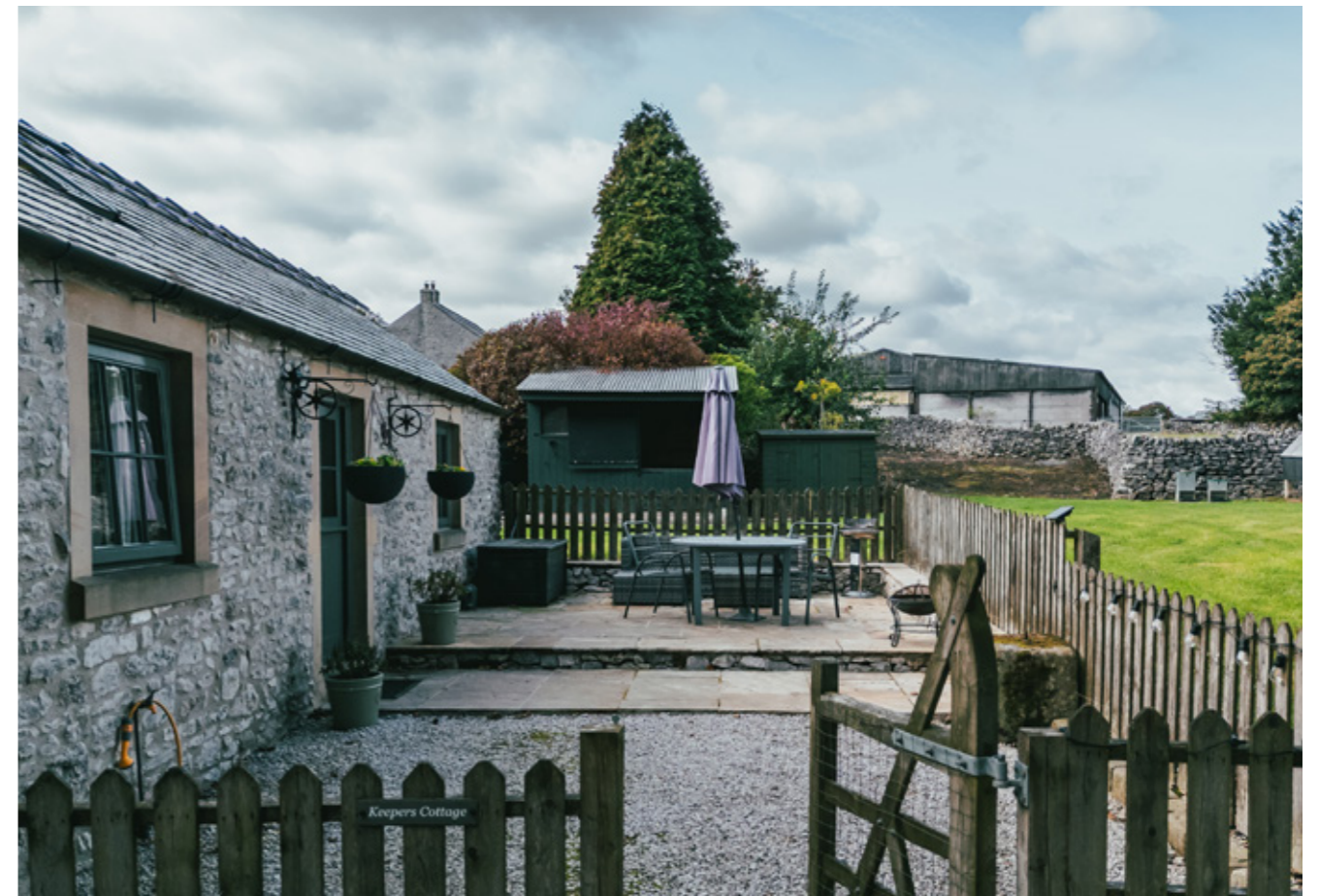
KEEPERS COTTAGE - EXTERIOR