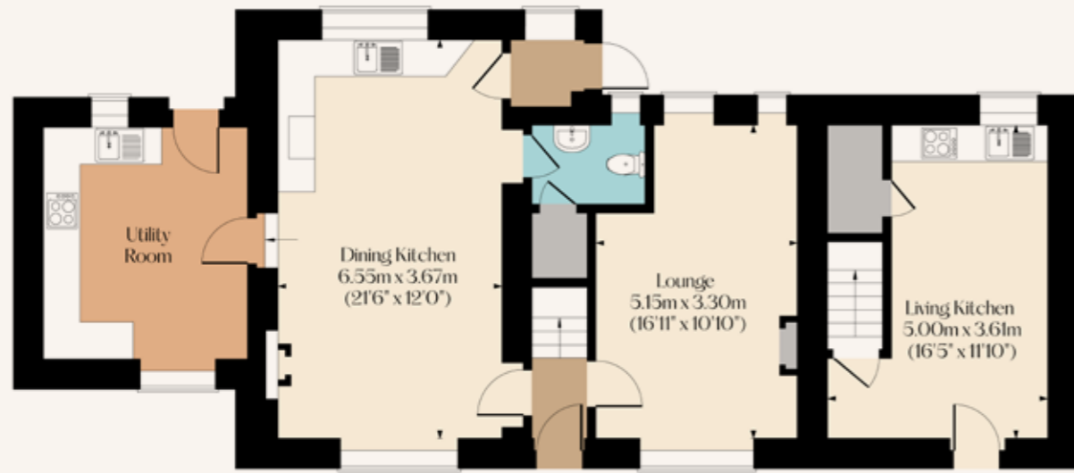
1 Bed Holiday Cottage Ground Floor

Total Approximate Floor Area: 1846 SQ.FT. (171.5 SQ.M)