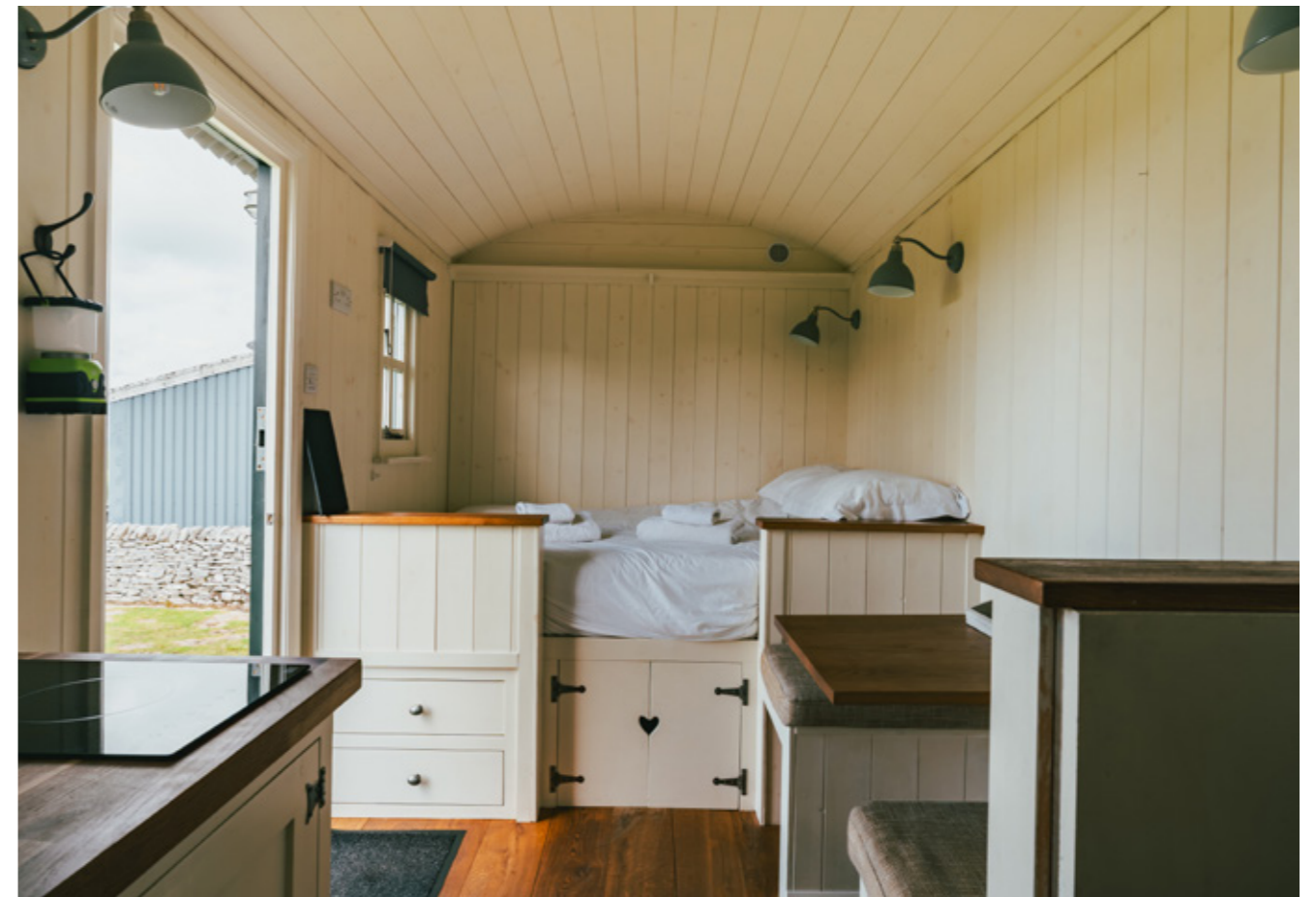
KITCHEN/BEDROOM - SHEPHERDS HUT