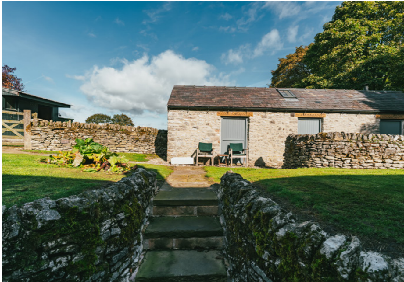
MAIN HOUSE GARDEN