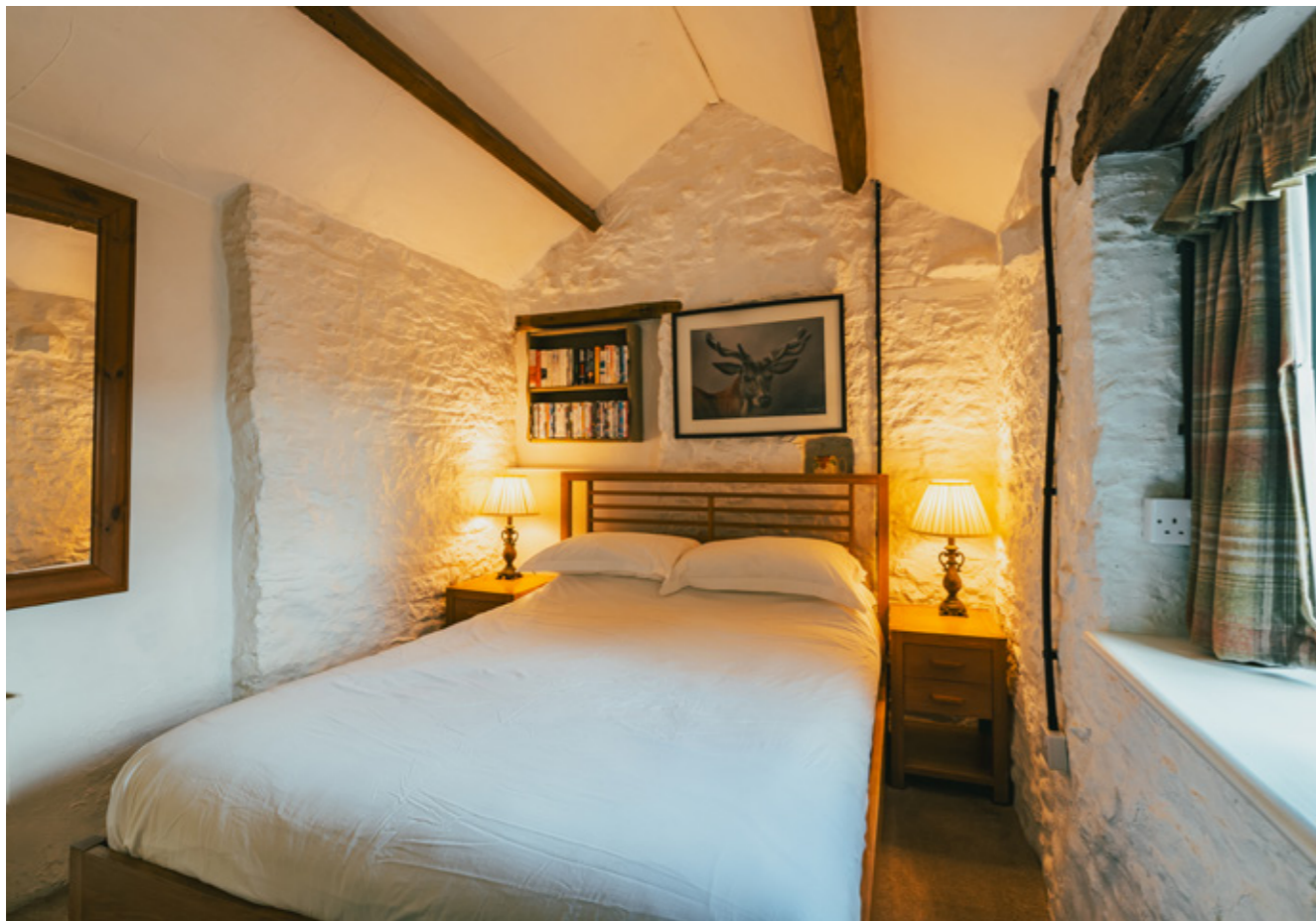
BEDROOM - KEEPERS COTTAGE