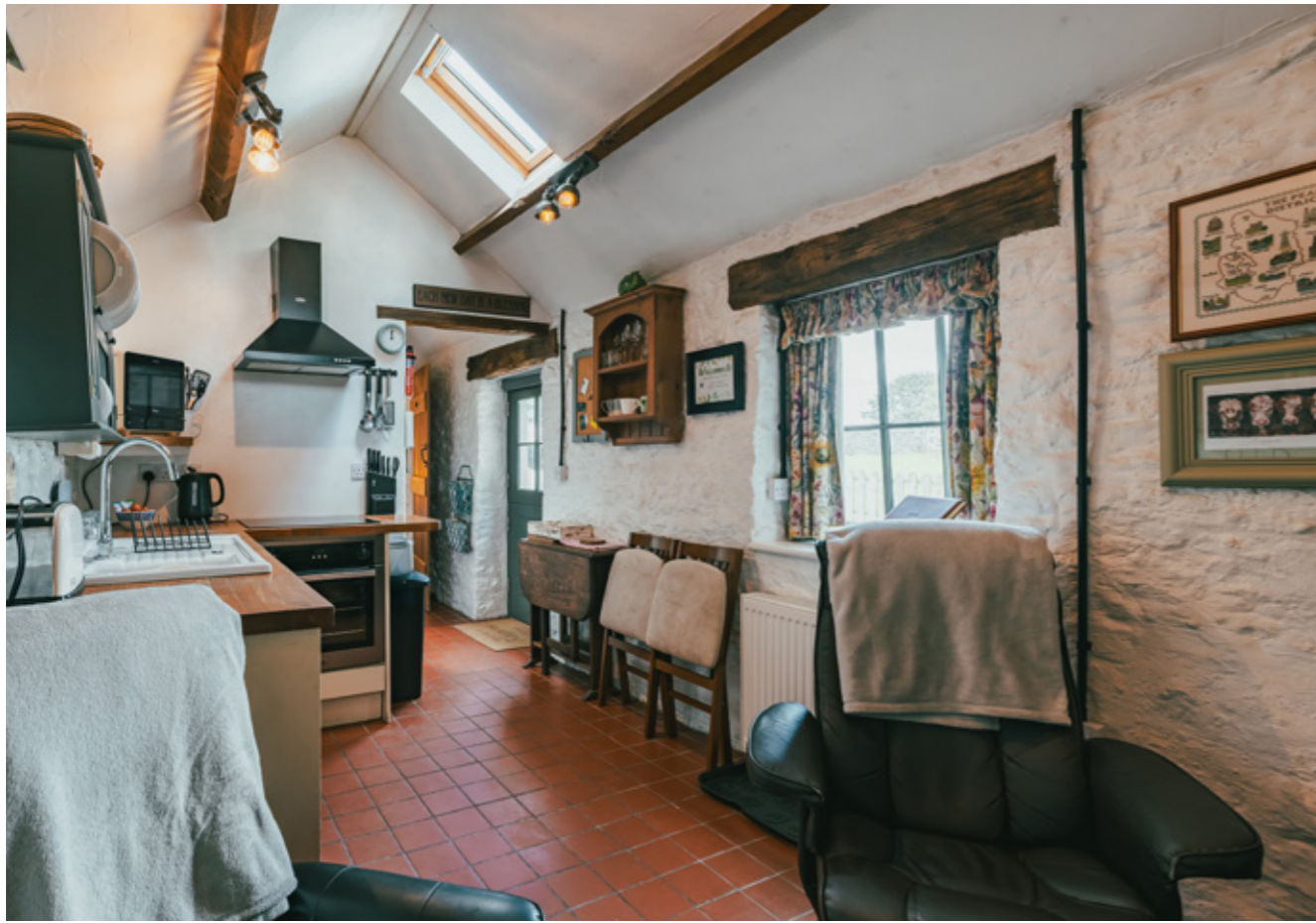
KITCHEN/LIVING AREA - KEEPERS COTTAGE