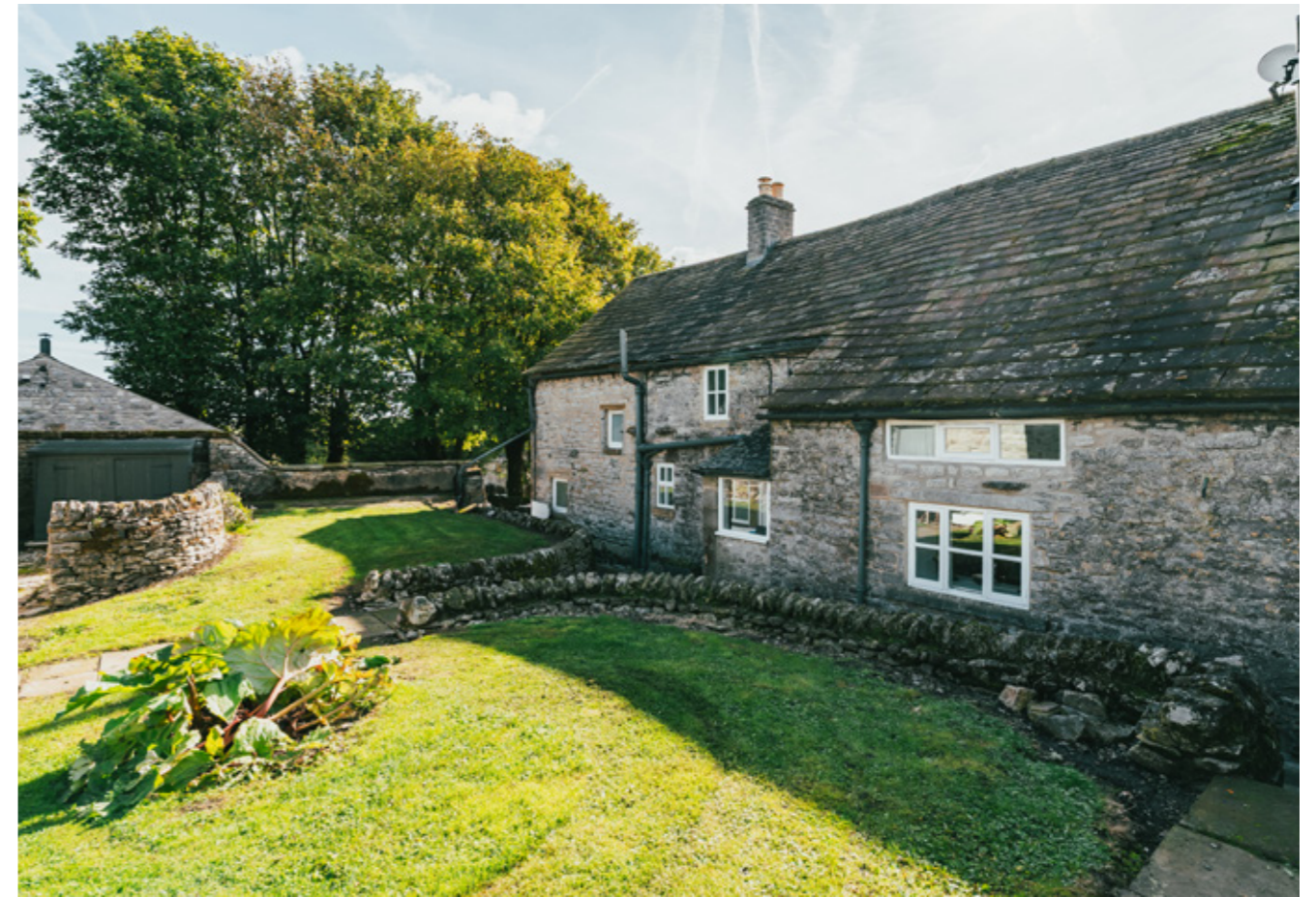
MAIN HOUSE GARDEN