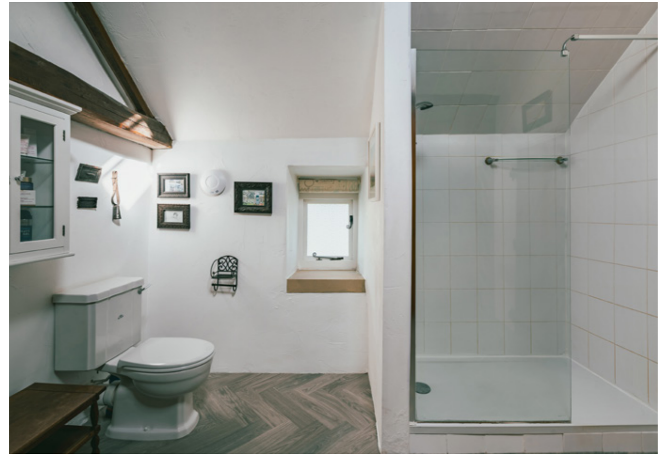
MASTER EN-SUITE BATHROOM