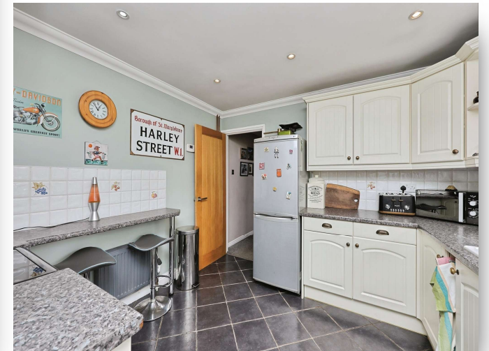
Burgh Lane, Mattishall, Dereham, NR20 3QP