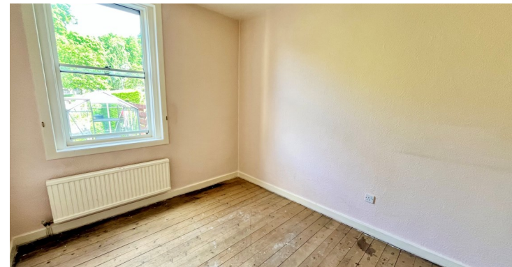
21 Main Street East