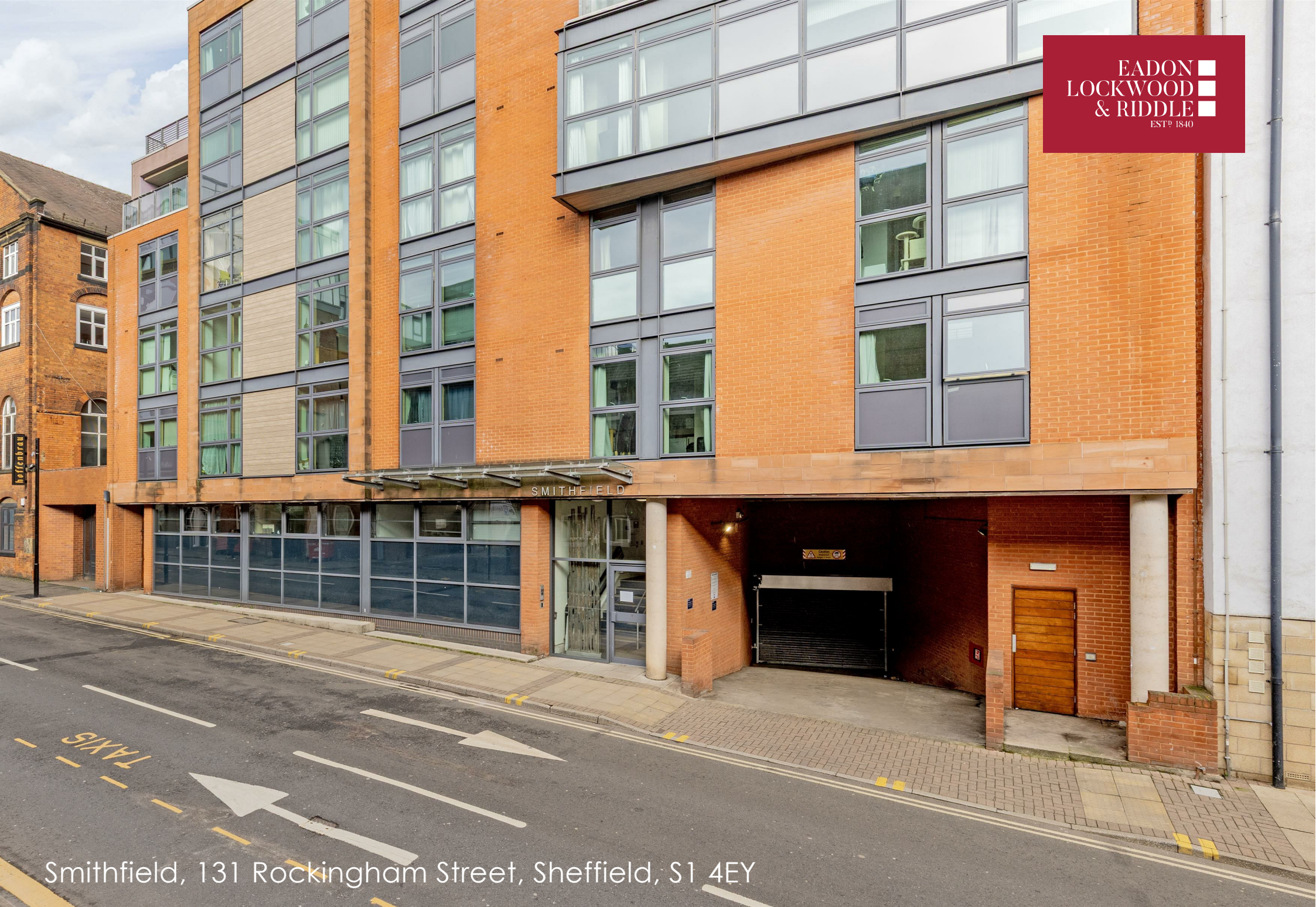
Smithfield, 131 Rockingham Street, Sheffield, S1 4EY