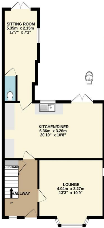
GROUND FLOOR 52.8 sq.m. (568 sq.ft.) approx.