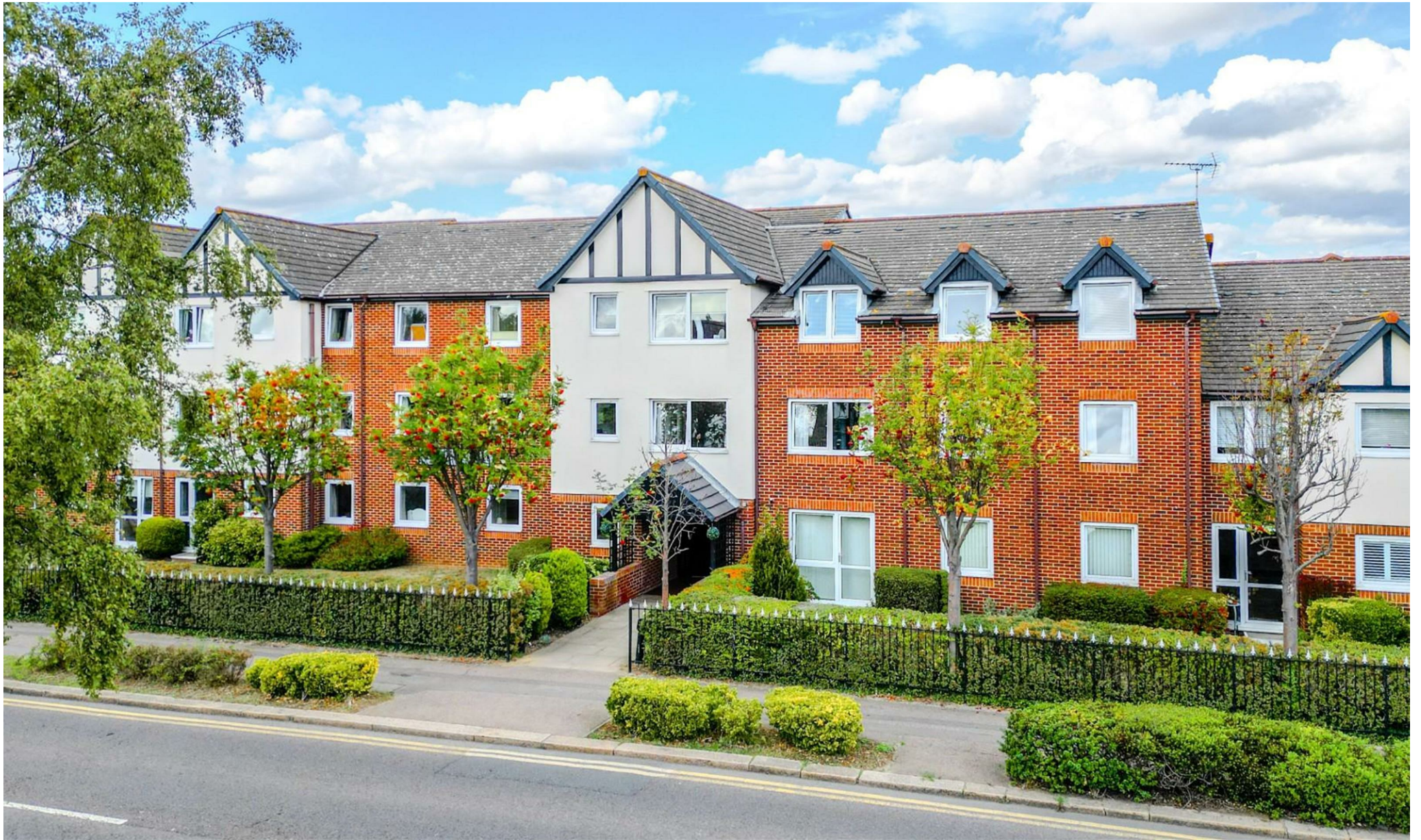
Station Road, Southend-On-Sea Offers Over £200,000