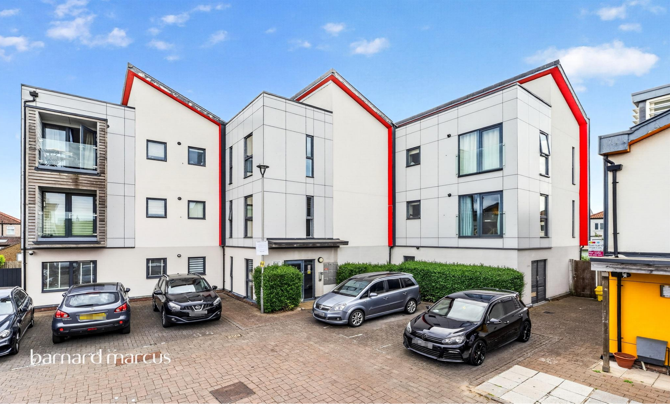
Fielding House Cairns Avenue, London SW16 5ER