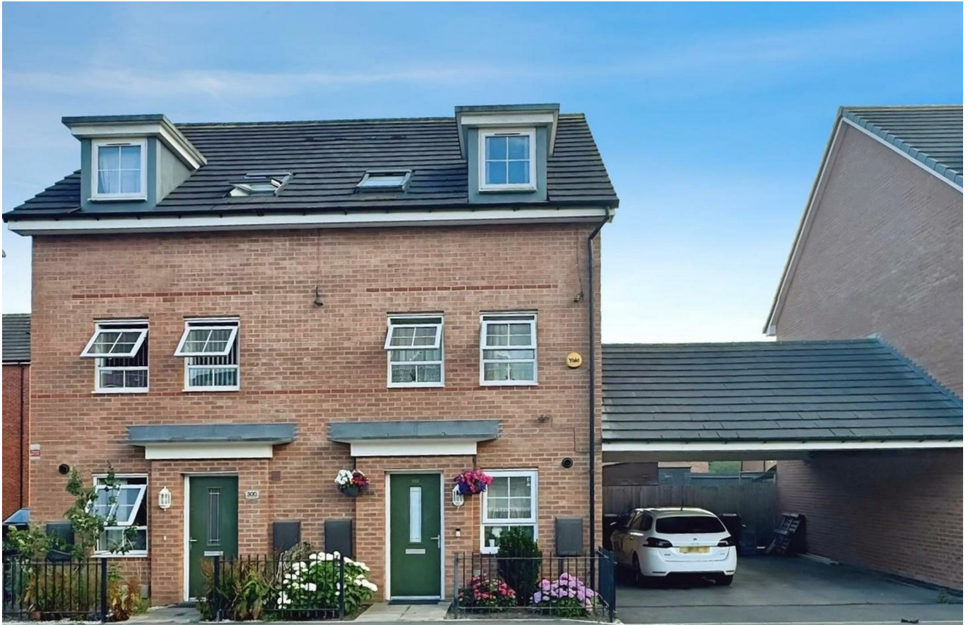
Queen Elizabeth Road, Camphill, Nuneaton