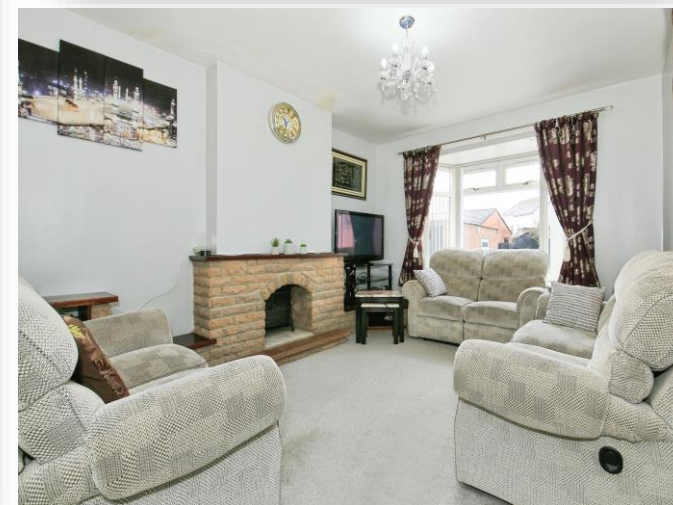
Alexandra Road, Peterborough PE1 3DE