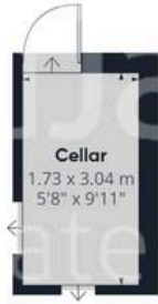
Floor -1 Building 1