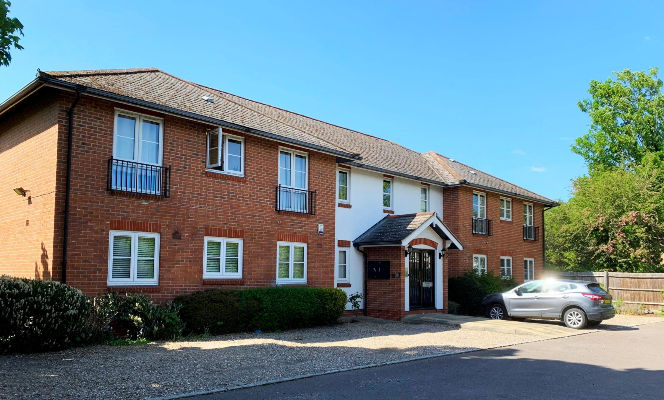
Howard Court, Henry Close, Enfield, EN2 9JT