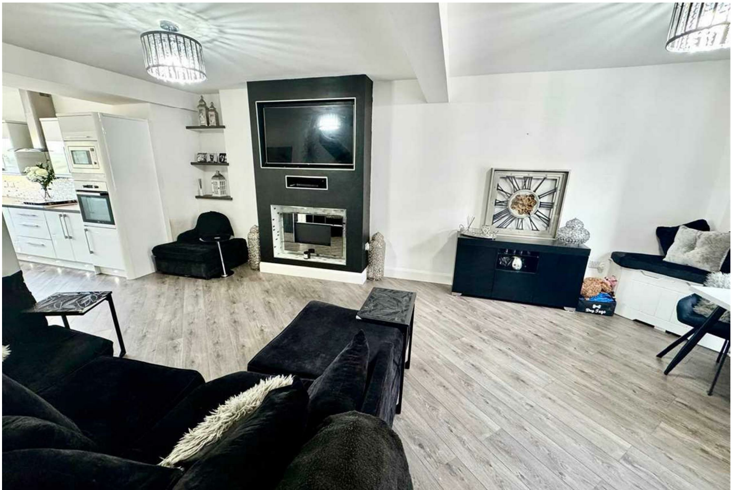
Lounge/Kitchen (Lower Ground Floor)..