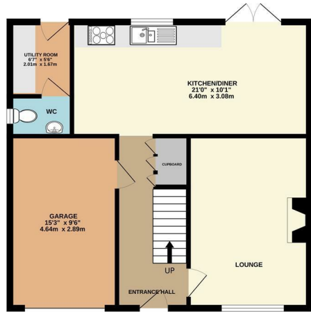
GROUND FLOOR 664 sq.ft. (61.7 sq.m.) approx.