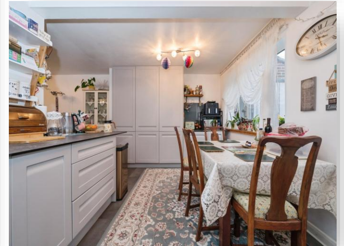
Bronte Way, Southampton SO19 7JG