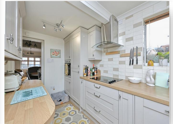
Neatishead Road, Horning, Norwich, NR12 8LB