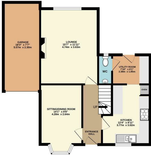
GROUND FLOOR 670 sq.ft. (62.2 sq.m.) approx.