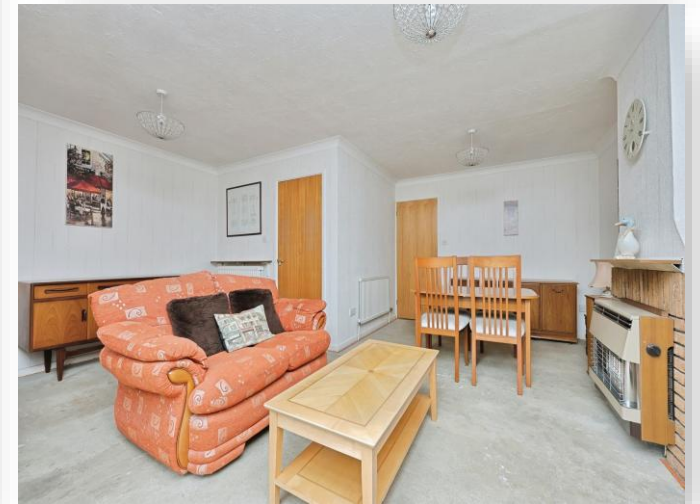
Aylesbury Close, Norwich, NR3 3LB