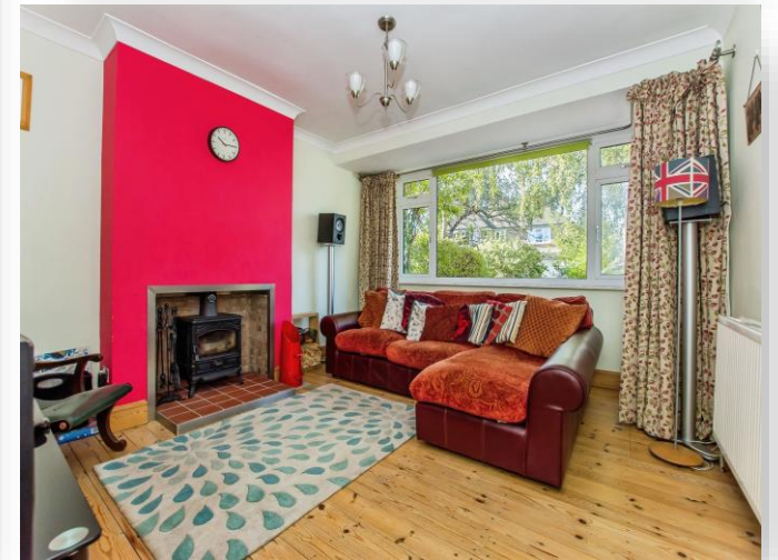
Mount Drive, Wisbech PE13 2BQ