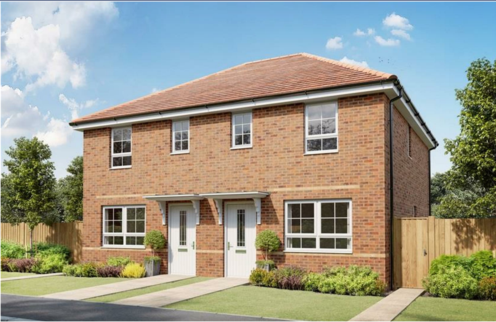
Talbot Place, Tilstock Road Whitchurch