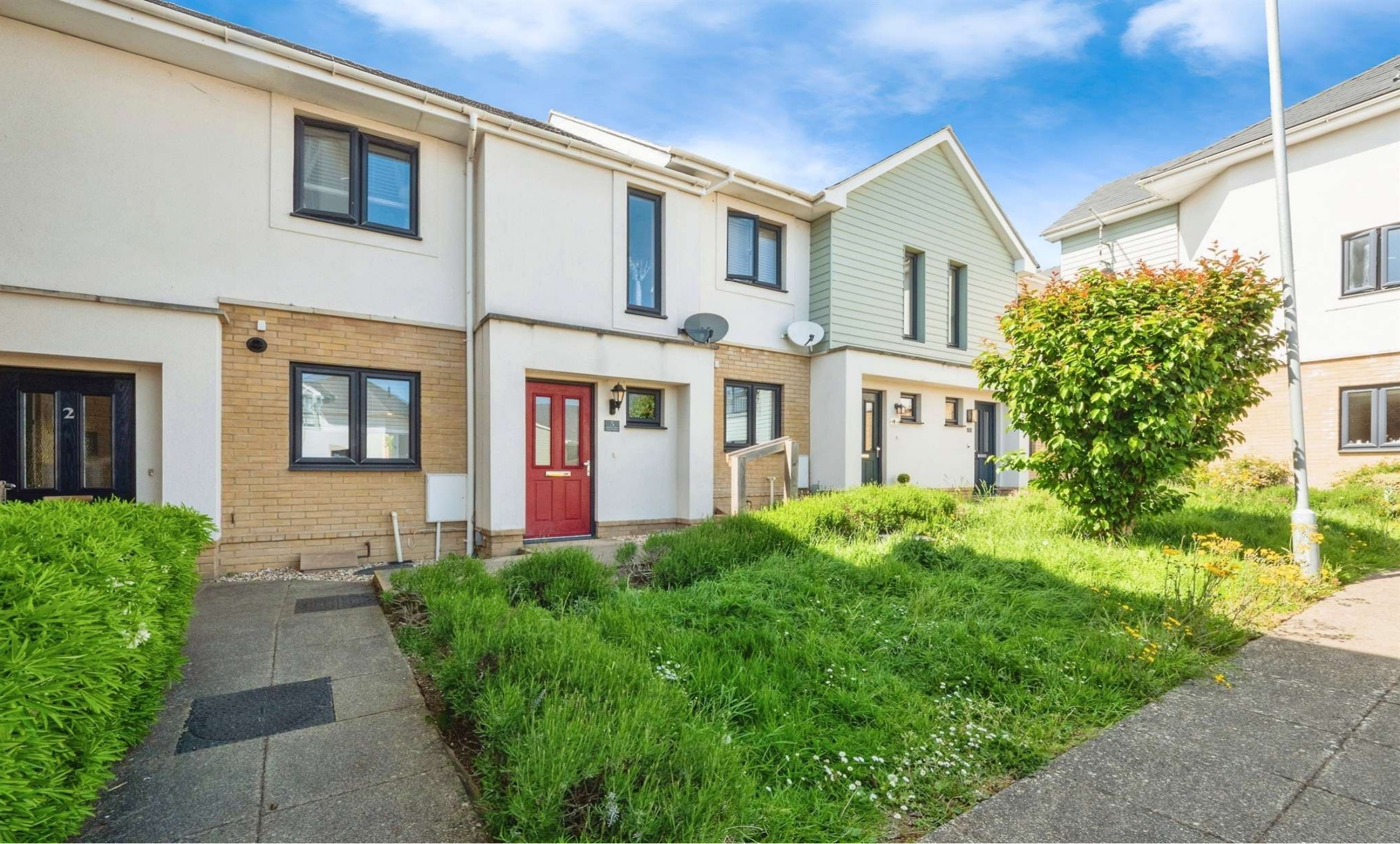
Addison Mews, Weymouth DT3 6FL