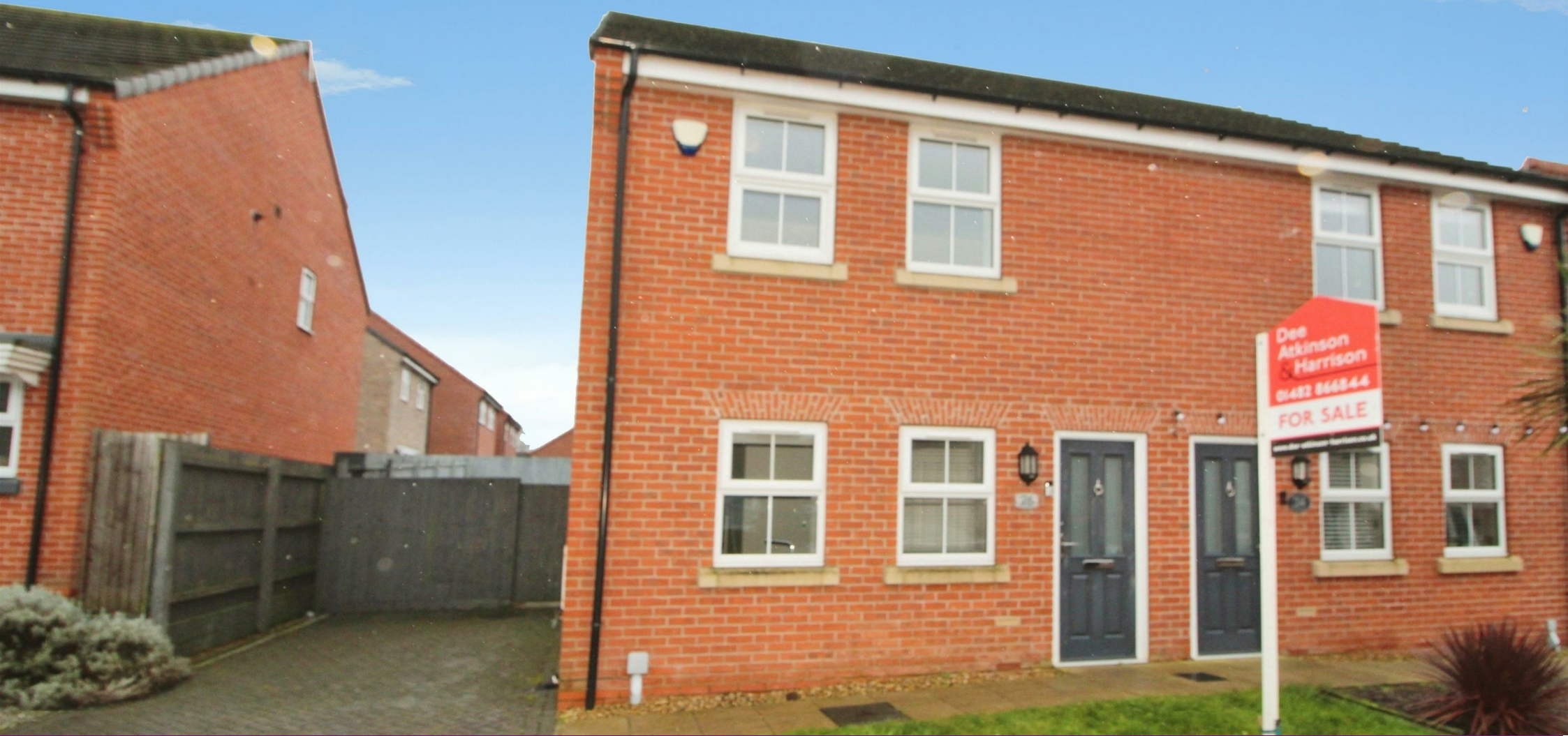
26 Rowton Drive, Skirlaugh, Hull, HU11 5DZ £195,000