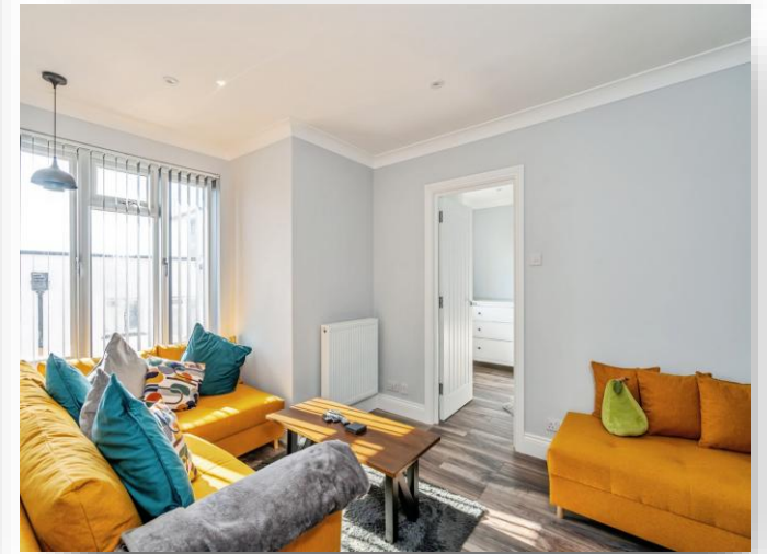
Streete Court Victoria Drive, Bognor Regis PO21 2RL