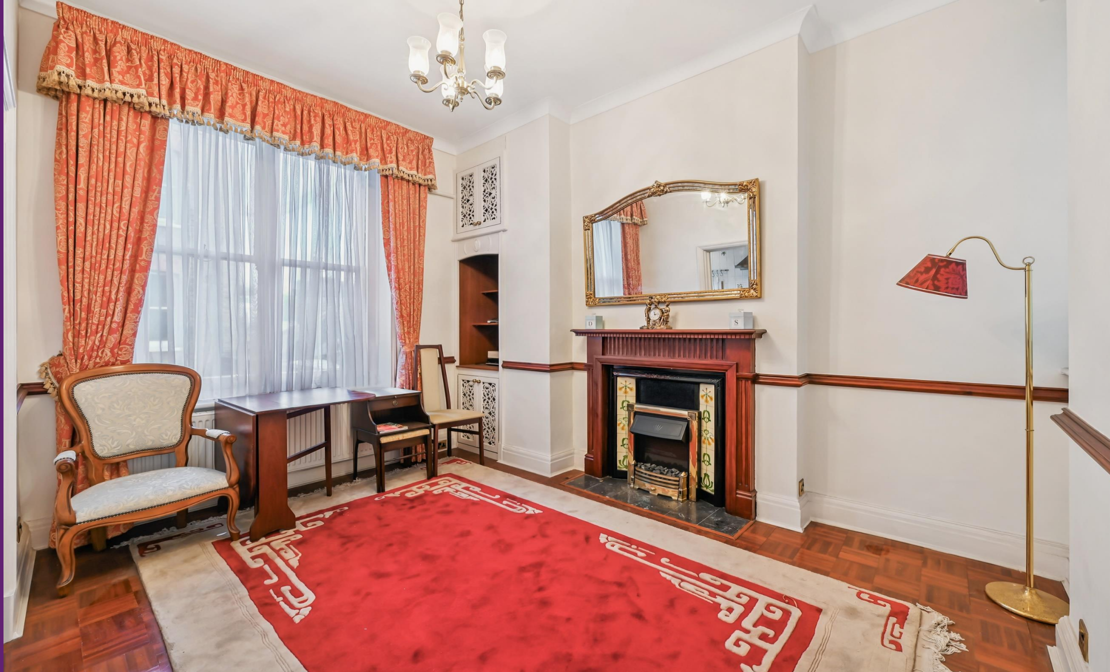
Stafford Mansions Stafford Place, SW1E