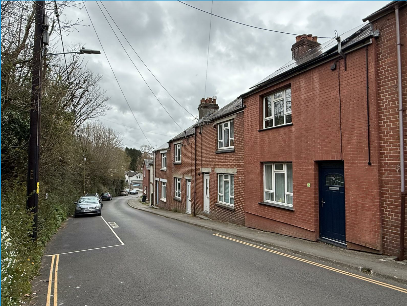
3 Western Terrace Launceston | Cornwall